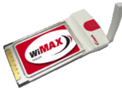
PC Card for Laptop users