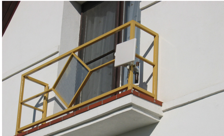
Typical installation of a WiMAX subscriber terminal on a single family home

http://www.wimaxxed.at/at/doc/video/wntv4260b.wmv